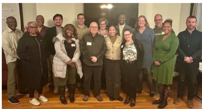
This incredible group of pastors and leaders are a pilot cohort for our Beloved Community Lab , a new curriculum we're developing to equip people to live as witnesses to the reconciling love of Christ