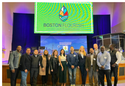
Boston Flourish leadership team, encompassing local pastors, business and non-profit leaders