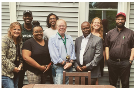
Fall Retreat with the UniteBoston Staff and Board to dream and plan out UniteBoston's program goals for the year