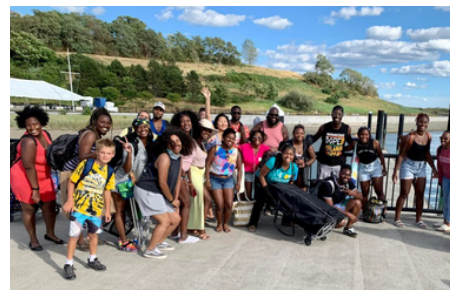
25 next-generation BIPOC leaders on a UniteBoston retreat to Spectacle Island to be renewed, recharge and reconnect.