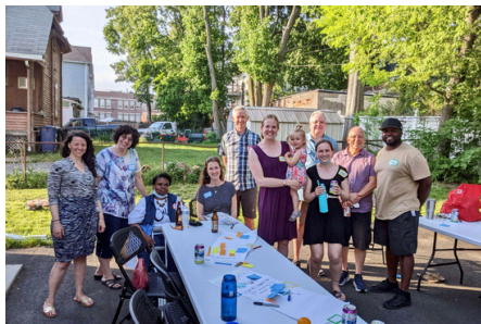
After a 2-day virtual training, the "Kingdom Conversations" cohort met to discuss applications in their own contexts