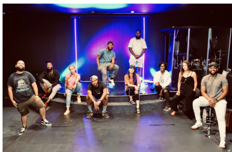
Seven local Christian artists sharing their prophetic voices in our " Love Boston " concert