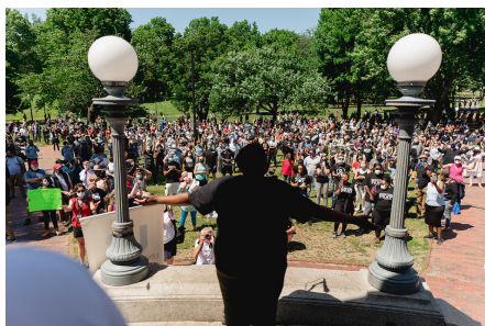
Worshipping with 1,000+ people spanning race, generation, and culture at BostonPray .