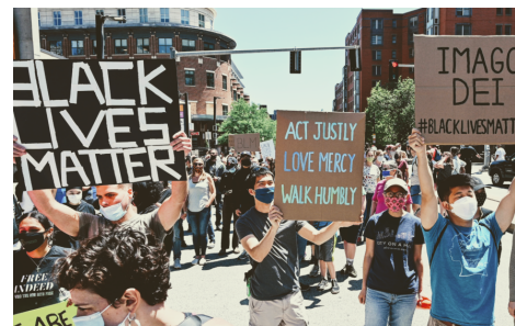
Building a movement towards racial reconciliation and justice as a core part of the Church's mission